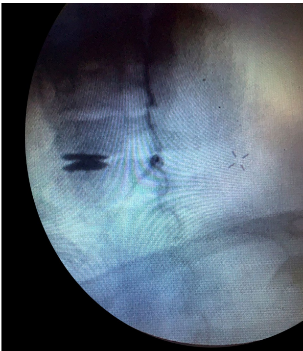
Figure 1. The spinal needle appears to remain inferior to the C7 foramen and posterior to the ideal location.

Subsequently, the patient was asked to resume a sitting position. Within the next minute, she first stated that she could not lift her right arm immediately after the procedure. Meanwhile, she started to feel weakness in her right leg and could not move her leg. In her examination, flaccid paralysis was detected in the right upper and lower extremities, and right-sided hypoesthesia was detected. No deficit was detected in the left-side muscle strength and sensory examination. The patient's deep tendon reflexes were evaluated as normoactive, and pathological reflexes (Hoffman and Babinski signs) were not found. It is well documented that reflexes can be preserved in spinal cord injuries, and pathological reflexes sometimes do not occur. [4] In addition, the weak response in the lower extremity to painful stimuli led us to doubt the diagnosis of SCI/ischemia. The patient complained of severe neck and back pain. Her blood pressure was 85/50 mmHg, and the pulse was 70/min. Urgently, 1,000 mL of saline 0.9% (isotonic saline solution) was given intravenously.