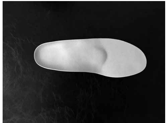
Figure 1. Medial longitudinal arch and transvers arch support insole, superior aspect.

4.17, 4.31, 4.56, 5.07, and 6.65 monofilaments were used in this study. A modified 4, 2, and 1 stepping algorithm was used to evaluate the pressure threshold at three locations on the plantar aspects of both of the participants' feet, including the heel, the medial forefoot and the lateral forefoot. The participants lay on their back in a quiet room and were blindfolded. The monofilaments were applied perpendicular to the skin of the foot being tested for a duration of 1-2 sec. When the examiner announced "now", a stimulus was or was not applied, thus introducing a forced-choice testing technique. Each test began with the 4.17 filament. Depending on the response of the participant, the changes in stimulus intensity were made in three increments, until the participant's response changed and a turnaround point was reached.