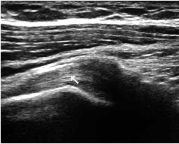
Figure 2. An ultrasonographic image of rotator cuff tendon.