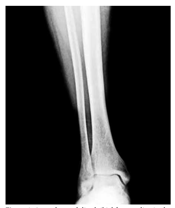
Figure 1. An undetected distal tibial fracture line in the anteroposterior radiograph of the left cruris.

Stress fractures occur when cyclic loading to the healthy bone exceeds the normal carrying range capacity.<sup>[2]</sup> These fractures most commonly affect athletes and military recruits who are engaged with intensive physical exercise in their daily lives.<sup>[1-3]</sup> Two types of SFs have been described according to etiology: fatigue fractures and insufficiency fractures.<sup>[5]</sup> A fatigue fracture occurs, when the healthy bone is exposed to abnormal muscular stress or torque. Many conditions leading an abnormal bone mineral content or elasticity such as osteoporosis, fibrous dysplasia, Paget's disease, rheumatoid arthritis, systemic lupus