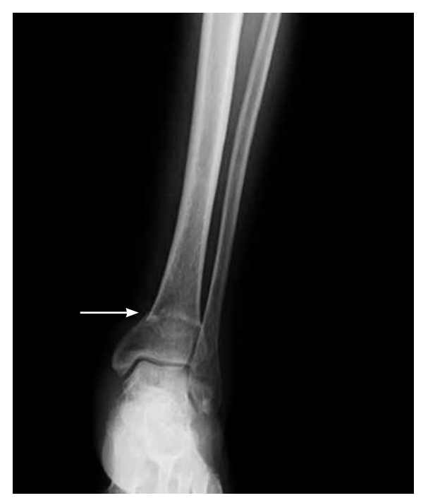
Figure 2. A transverse fracture line in the distal tibia in the anteroposterior left cruris plain radiographs.