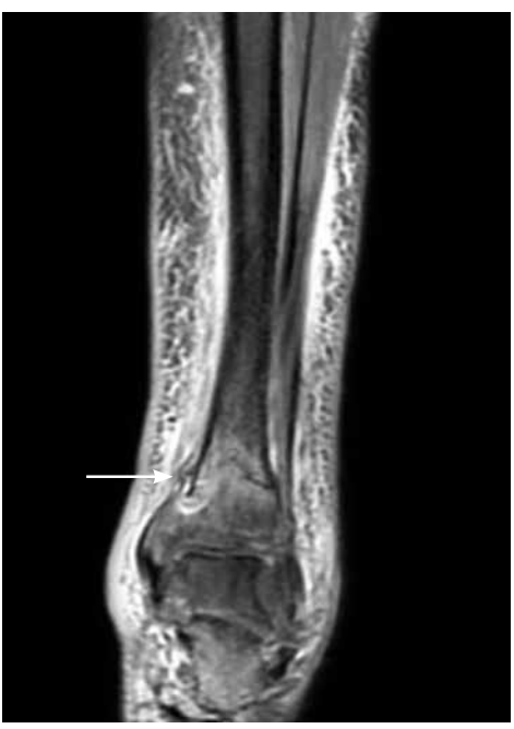
Figure 4. A coronal fat-sat magnetic resonance imaging of the left cruris showing a non-displaced fracture line in the distal tibial metaphyseal region.