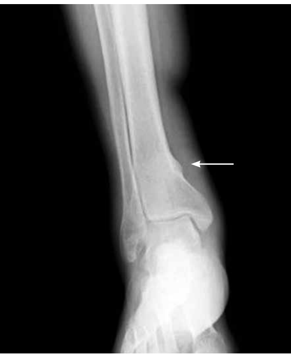
Figure 3. An anterior-posterior radiograph of right cruris showing an improved right distal tibial fracture line.

erythematosus, calcium pyrophosphate deposition and, diabetes mellitus may lead to the formation of insufficiency fractures. In addition, heavy smoking, inhaled steroid use, and amenorrhea are