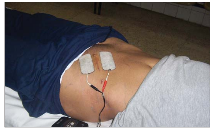
Figure 1. Electrodes placement and TENS unit application.

All interventions were performed in the inpatient ward of the general surgery department and physical therapy department of Mataria Teaching hospital. For all subjects, the physical therapist applied active or placebo TENS using a dual-channel WELL-TENS device (WELL-Life Healthcare Limited, Taiwan) with a pulse frequency range of 0-160 Hz and an intensity of 0-100mA. Each subject received 30 minutes of TENS treatment twice daily at 7 am and 7 pm for five consecutive days. Two 15cm sterile adhesive electrodes were removed from their sterile protective coverings, placed longitudinally on either side of the incision and connected to pin connectors. The mode of conventional TENS therapy was adjusted to frequency of 100 Hz and pulse width of 120 \mu sec. The intensity of amplitude was adjusted individually based on patient tolerance between 10-30 mA generating a perceptible tingling sensation without significant muscle contraction.