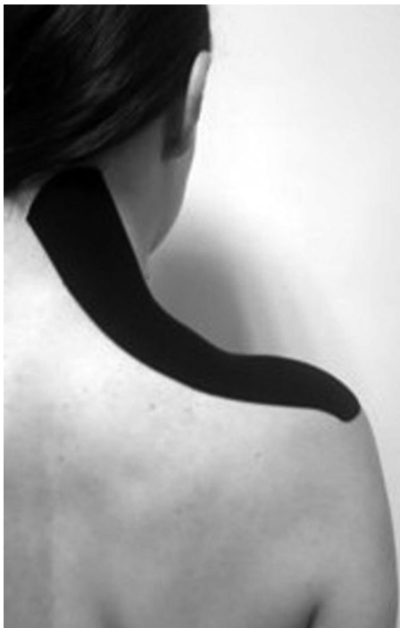
Figure 1. Intervention group-Kinesiotaping.