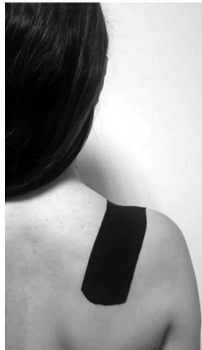
Figure 2. Control group-Kinesiotaping.

weeks after the treatment using the visual analog scale (VAS)-pain, pain threshold measurement by algometry, and Neck Pain and Disability Scale (NPAD)-function. The quality of life was evaluated using the Nottingham Health Profile (NHP). Furthermore, the Likert scale was used to evaluate the patient satisfaction degree at three and six weeks after the treatment. All patients were allowed to take paracetamol as an analgesic, if necessary. They were also instructed to record exercises and medications used.