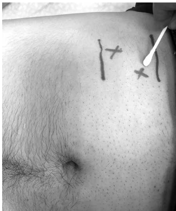
Figure 1. Cotton swab test. Cotton swab can be used to assess allodynia or hyperalgesia, suggesting a possible abdominal wall neuropathy.

In CPP, biochemical and hormonal tests should be requested according to the history and physical