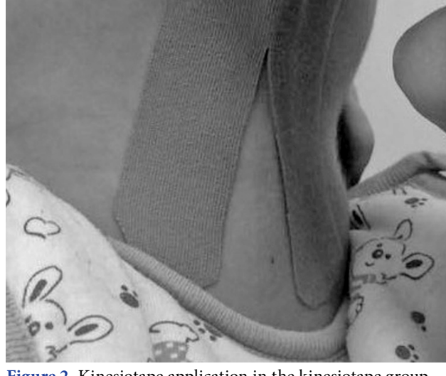
Figure 2. Kinesiotape application in the kinesiotape group.

In both groups, the application was performed twice a week for six weeks. After three days of application, the kinesiotape was removed for one day of resting, then again applied for three days. The application was performed by the same specialist. The Y-type kinesiotape (Kinesio Tex, Gold; Kinesio UK, Newcastle upon Tyne, UK) was applied to all kinesiotape groups by the muscle technique, and the tail part of the Y strip was adhered with 10 to 15% stretching under the mandibular line to the origins of the mylohyoid muscle 2.5 to 3.5 cm in width according to the age of the child. The strip, which was brought as a whole to the imaginary line passing through the posterior corners of the mandible, was adhered to the hyoid bone just over the top to prevent direct taping of the hyoid bone. The arms of the band were glued up to the level of the manubrium sterni as a paper-off tension to prevent the facilitation of the sternohyoid muscle (Figure 2). In the sham group, kinesiotape was applied without stretching to the suprahyoid region and not including the origins of mylohyoid and digastric muscles (Figure 3).