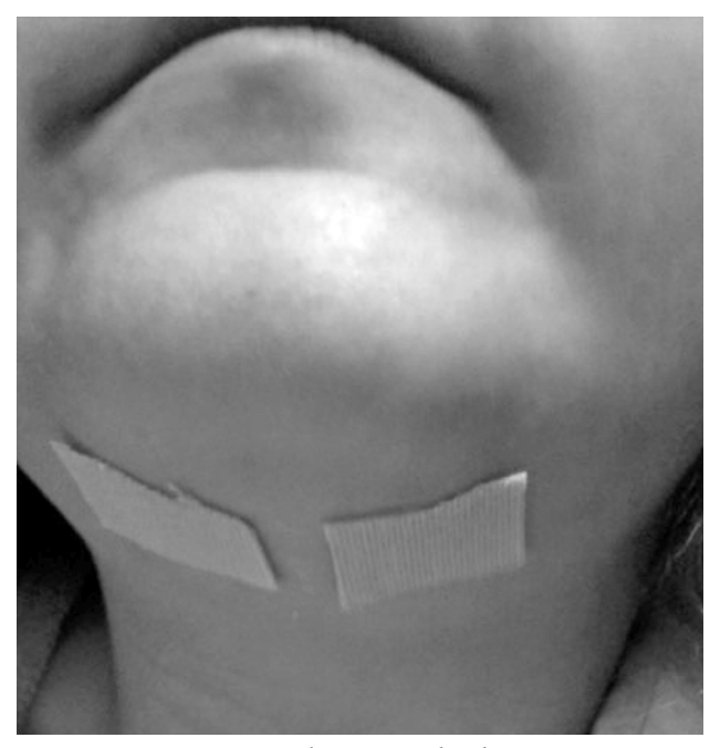
Figure 3. Kinesiotape application in the sham group.