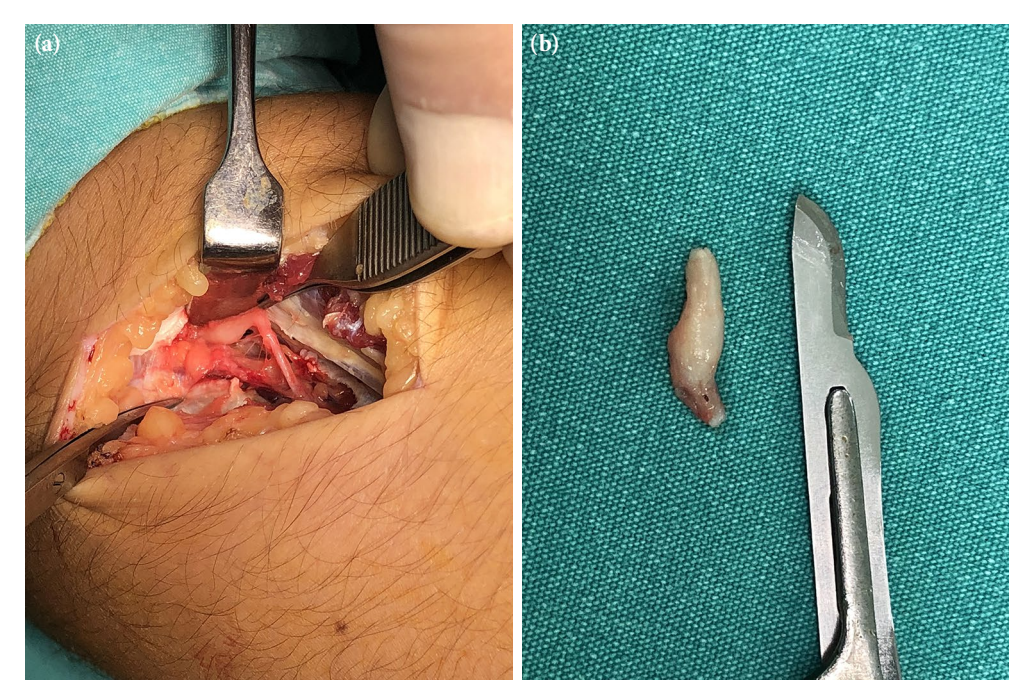
Figure 2. (a) Intraoperative photograph demonstrating the mass in the PIN. (b) The resected fusiform mass.

fusiform mass was resected, and no nerve repair was done since there was apparent muscle atrophy of the extensor compartment innervated by the PIN (Figure 2). Alternatively, the tendon transfer of flexor carpi radialis to the extensor digitorum communis and palmaris longus to the extensor pollicis longus was performed. The histopathological study of the resected mass confirmed the diagnosis of neurofibroma. A hand rehabilitation program was then started in the postoperative period.