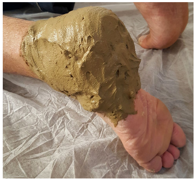
Figure 2. Peloidotherapy application in unilateral plantar fasciitis.

was conducted in accordance with the principles of the Declaration of Helsinki.