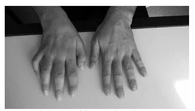
Figure 2. The position of the patient's hand.

Compound muscle action potentials (CMAPs) were recorded from the ADM by surface electrode in response to the stimulation at the wrist, below elbow, and above elbow. The CMAPs amplitude (0.2 mV- the lower limit of ulnar CMAP is 8.7 mV according to our EMG laboratory) were significantly decreased at all site of stimulations. Sensory nerve action potentials of the right ulnar nerve from the fifth finger and right DUC nerve were unable to be obtained. Electromyography of the right ADM, FCU, FDP showed severe reduction in voluntary recruitment with fibrillation potentials and positive sharp waves. There was no abnormality in