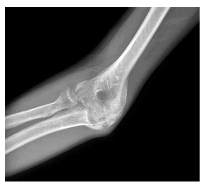
Figure 3. The X-ray image of the patient's right elbow.

Ultrasonographic evaluation of the ulnar nerve throughout the right upper extremity (starting from the axilla until the wrist) was done using a linear array probe (7-12 MHz Logiq P5a). All the measurements were performed in axial views. The right ulnar nerve was observed expanded at the level of the right retro epicondylar groove (14.2 mm<sup>2</sup>) (Figure 4). The ultrasonographic evaluation also revealed accompanying heterotopic bony spurs located very proximity to the right ulnar nerve.