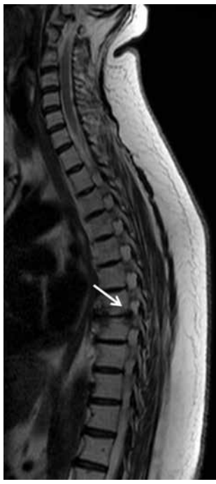
Figure 1. Sagittal T<sub>2</sub>-weighted magnetic resonance image showing disc height loss, endplate and disc degeneration, left paracentral disc herniation (arrow).

When 12 levels in 195 cases were taken into consideration, disc bulging/herniation were determined in 412 (18%) levels among the total of