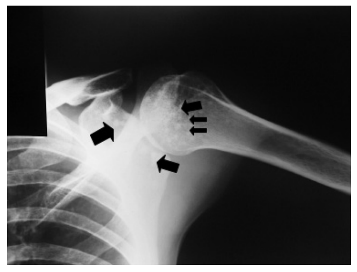
Figure 2. Anteroposterior radiograph of the left shoulder. Black arrows show the humeral head and widely distributed, small, well-circumscribed and circular sclerotic bone lesions around the glenoidal cavity

In the examination and inspection of the patient, no skin lesions or rashes, including those in the scalp, were encountered. Other systemic examination findings were normal. In the musculoskeletal examination, tenderness was detected in the following joints: 1<sup>st</sup> right metacarpophalangeal (MCP) joint; 2<sup>nd</sup>, 3<sup>rd</sup>, and 4<sup>th</sup> MCP, 4<sup>th</sup> proximal left interphalangeal (IP) joint; right 1<sup>st</sup>, 2<sup>nd</sup>, 3<sup>rd</sup>, 4<sup>th</sup>, and 5<sup>th</sup> metatarsophalangeal (MTP) joints; left 2<sup>nd</sup> and 4<sup>th</sup> MTP joints, right ankle; and anterior aspect of both shoulder joint capsules. However, no arthritis was detected in any joint. Waist and hip movements were unaffected and painless. Patrick's test was positive on the left at the border. His neurological examination was normal. In laboratory examination, routine biochemistry, erythrocyte sedimentation rate, C-reactive protein, urinalysis, and tumor marker levels were normal. In