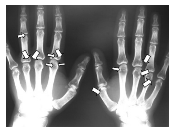
Figure 3. Bilateral anteroposterior radiograph of the hand. White arrows show widely distributed sclerotic lesions

In the examination and inspection of the patient, no skin lesions or rashes, including those in the scalp, were encountered. Other systemic examination findings were normal. In the musculoskeletal examination, tenderness was detected in the following joints: 1<sup>st</sup> right metacarpophalangeal (MCP) joint; 2<sup>nd</sup>, 3<sup>rd</sup>, and 4<sup>th</sup> MCP, 4<sup>th</sup> proximal left interphalangeal (IP) joint; right 1<sup>st</sup>, 2<sup>nd</sup>, 3<sup>rd</sup>, 4<sup>th</sup>, and 5<sup>th</sup> metatarsophalangeal (MTP) joints; left 2<sup>nd</sup> and 4<sup>th</sup> MTP joints, right ankle; and anterior aspect of both shoulder joint capsules. However, no arthritis was detected in any joint. Waist and hip movements were unaffected and painless. Patrick's test was positive on the left at the border. His neurological examination was normal. In laboratory examination, routine biochemistry, erythrocyte sedimentation rate, C-reactive protein, urinalysis, and tumor marker levels were normal. In