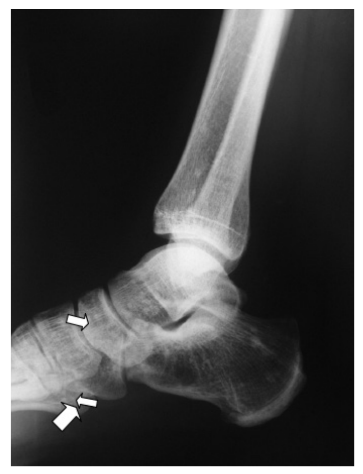
Figure 6. Radiograph of the left side of the ankle of the mother of 26-year-old patient. The white arrows show well-circumscribed sclerotic lesions

The patient was diagnosed with characteristic radiological findings and osteopoikilosis by excluding other differential diagnoses. The patient was informed about the disease and was followed up. Similar lesions were observed in the evaluation of patient's mother among the other family members at our polyclinic; the mother had prominent lesions in her left ankle (Figure 6). The family was directed to the department of genetics for genetic examination. Paracetamol 1500 mg/day was started as treatment for the patient's hip pain. A decrease in hip pain was detected in the follow up a month later. A written informed con-