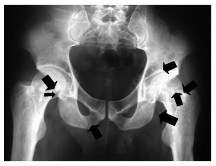
Figure 1. Anteroposterior radiograph of the pelvis. Black arrows show the femoral head and proximal acetabulum; a number of small, well-circumscribed, circular sclerotic bone lesions in the ischium