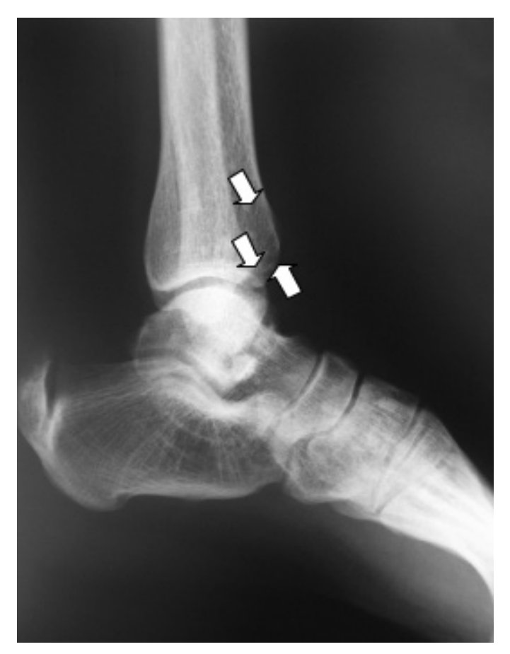
Figure 4. Radiograph of the left ankle. White arrows indicate sclerotic lesions

the radiological assessment, no pathological findings were found in lumbar and chest radiographs. Scattered, small, well-