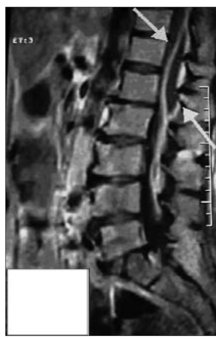
Figure 1. Lumbosacral MRI with gadolinium demonstrated epidural abscess (arrows).

On the third day, the lumbar pain began to subside and we could examine the patient. The positive findings of physical examination were paravertebral muscle spasm in the lumbar region, restriction of lumbar range of motion in all planes, decreased touch sensation below L2, decreased proprioception and vibration senses bilaterally, absence of patella reflexes and decreased achilles reflex, and motor weakness. The muscle