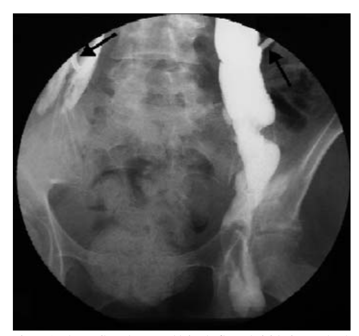
Figure 3. The cavitograhy was obtained after administering contrast from catheters (arrows) at the prone position. Psoas abscess at the right side extended to the caudal femoral region.

We diagnosed bilateral psoas abscess in connection with spinal epidural abscesses. The psoas muscle lies in close proximity to the spinal column. Psoas arises from the lumbar vertebrae and inserts at the thoracic vertebra. Based on the radiological appearance and the clinical findings, the epidural and psoas collections were likely to be a continuation of each other due to the close proximity of these structures, but we could not conclude whether the psoas abscess originated from