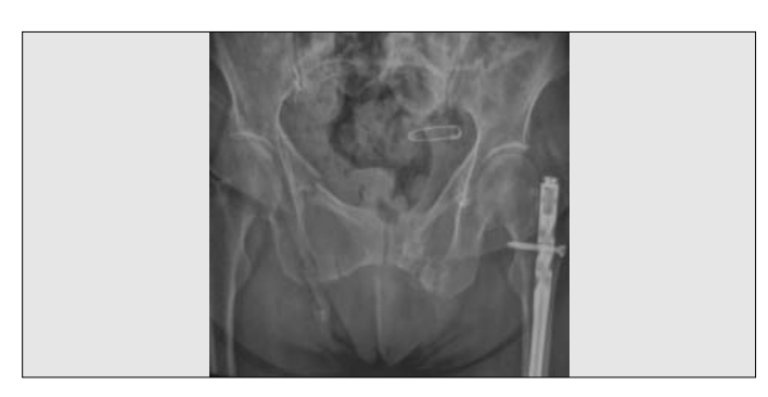
Figure 2. New fracture lines in right superior and inferior pubic ramus and left inferior pubic ramus, old fracture line in left superior pubic ramus with callus formation and intramedullary fixation material in left femur.